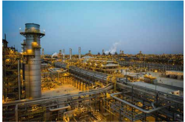
Image of The Fadhili gas plant in Saudi Arabia's eastern province.

Saudi Aramco and SABIC have announced their selection of Yanbu, on the west coast of Saudi Arabia, as the site for the development of an integrated industrial complex to convert crude oil to chemicals (COTC). The announcement by Saudi Aramco and SABIC, the two largest industrial entities in the Kingdom, reflects the high importance both companies place on making the Kingdom a key hub for global chemicals production. The COTC complex is expected to process 400,000 barrels per day of crude oil, which will produce approximately 9 million tons of chemicals and base oils annually and is expected to start operations in 2025.