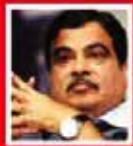
NITIN GADKARI Shipping Minister

The project includes modernisation of our ports and Islands, setting up of coastal economic zones, new major ports and fish harbours